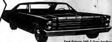
Ford Galaxie 500 2-Door Hardtop

Year's lowest prices! Year's highest trades! Ultra-quiet big Fords, thrifty Falcons and Fairlanes, fun-packed Mustangs! Big selection of models and colors—if you hurry!