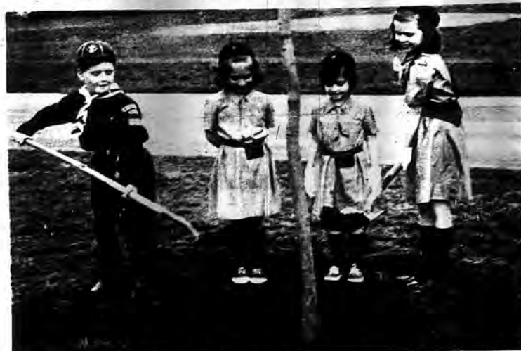
AN ARBOR DAY CEREMONY was held on the grounds of the Willot Avenue School in Hicksville on Apr. 29. A Norway Maple tree, donated by the P.T.A., was planted in memory of Robert Frost, America's Poet. The first of the trees dedicated to famous Americans was planted in 1963, in honor of President John F. Kennedy. General Douglas Mac Arthur was remembered with last year's tree.