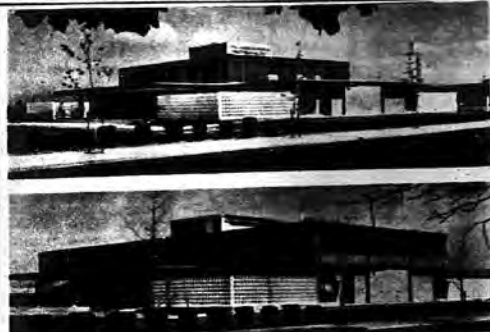
LEVITTOWN OFFICE of The Williamsburgh Savings Bank as it appeared after completion in 1963, comprising a main banking floor with a windowed clerestory above to admit ample daylight, and a full lower level containing vaults, kitchen, indoor and outdoor dining facilities and recreation areas. Lower photo shows building's new squared-off appearance with recently completed addition of two mezzanine areas connected by a rail-protected walkway adjacent to one of the remaining clerestory window areas. The addition was designed by Frederic P. Wiedersum Associates, Architects-Engineers of Valley Stream who also planned the existing building for which expandability was an important part of the initial design. Thus, the new addition is now an integral part of the bank's interior and exterior rather than appearing merely as a structural afterthought and was accomplished easily and economically.