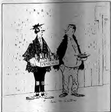
"Do you keep your books on a fiscal or calendar year basis?"