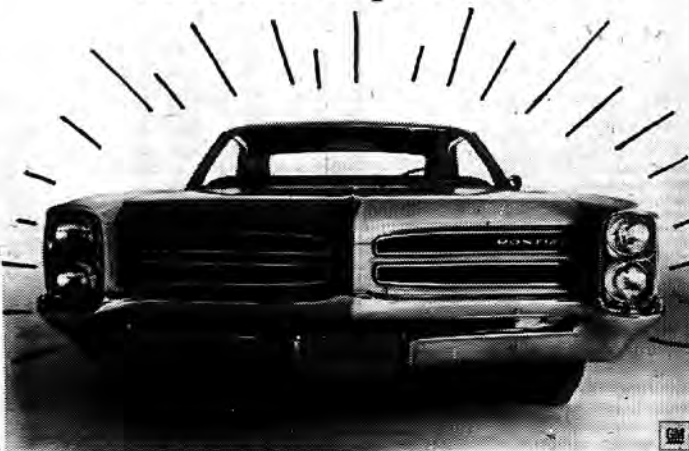
Safety items like front and rear seat belts are standard on every '66 Pontiac.

We have a problem with our Catalina we just can't fix. It looks expensive.