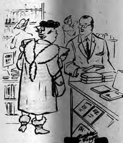
"Instead of the six volumes of Hawthorne, I think I'll take the two volumes of Longfellow. He's easier to dust."