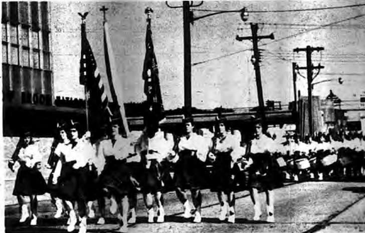
COLOR GUARD of St. Ignatius Girls Cadet Corps steps out smartly during a parade in Hicksville. The Corps has made numerous appearances in New York, New Jersey and in Canada.