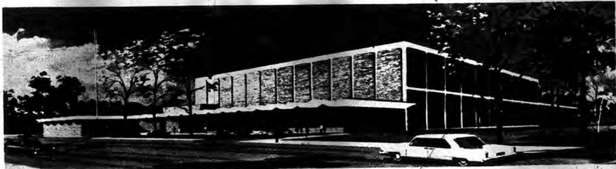
GIANT NEW POST OFFICE for Hicksville will provide nearly three acres of gross area, house facilities now spread over three locations.