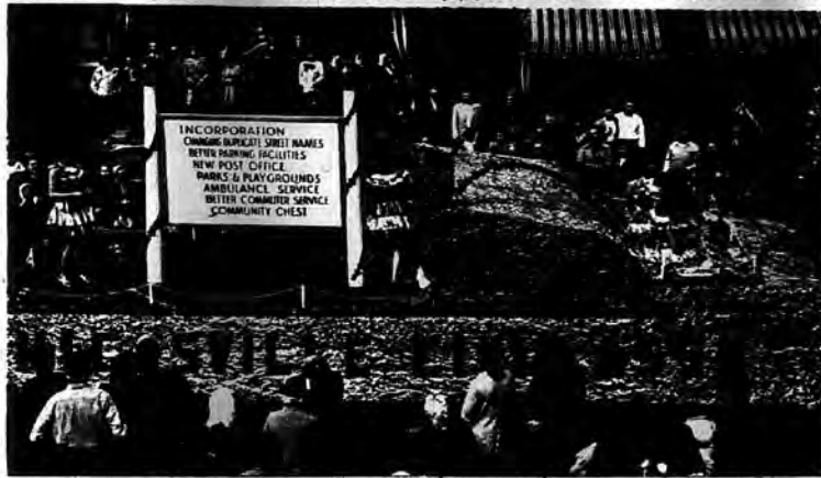
HICKSVILLE CIVIC ASSOC. was an important organization in the community in 1948 when the community celebrated its 300th anniversary with a grand parade of floats. The Civic Assoc. float represented weeks of work and featured the organizations platform which include: "Incorporation, changing duplicate street names (achieved), better parking facilities (achieved), new post office, parks and playgrounds (partially achieved), ambulance service (achieved), better commuter service (anyone's guess), and community chest". (Fourth in a series of photographs by Bowman and Brown).