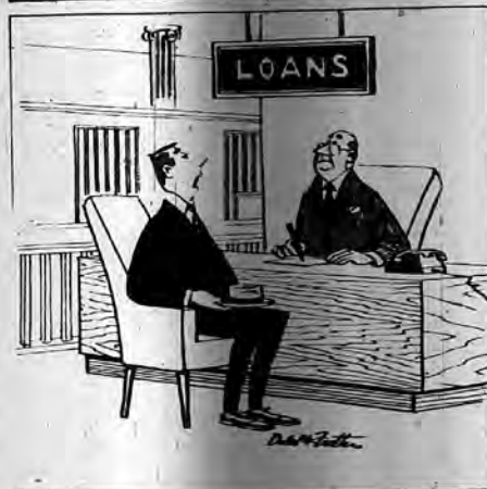
"I have enough money to pay my taxes - I need something to live on."