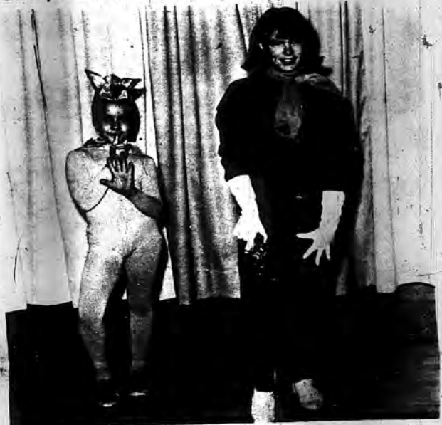
ALLEY CATS, a dance number.

THIRTY SIX BOYS AND GIRLS, aged 9 to 16, all sons of the American Legion and members of the Junior Auxiliary of the Charles Wagner Post 421, American Legion, Hicksville, entertained patients at Kings Park on Nov. 14, the inmates at Jones Institute in Hicksville on Dec. 19 and members of the Post and Auxiliary and friends