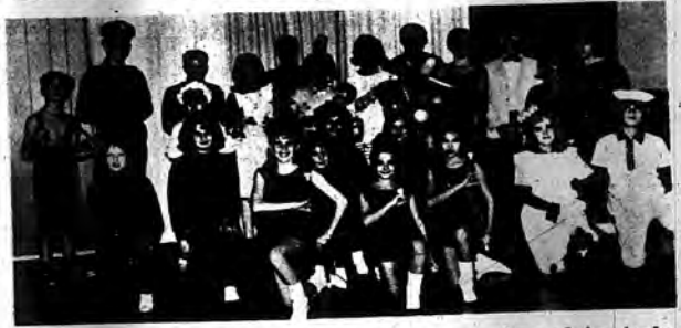
THE ENTIRE CAST of sons of the Legion and members of the Junior Auxiliary of the Charles Wagner Post.