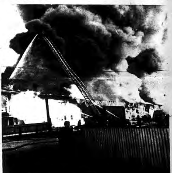
ROARING FLAMES gutting the entire building from Old Country Rd. south along the LIRR-