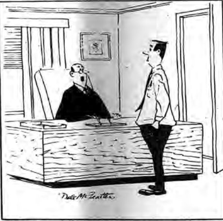
Lisn't it a comfort, Argyle, to know that in these days of inflationary spirals, your salary is the one stable element in the economy?"