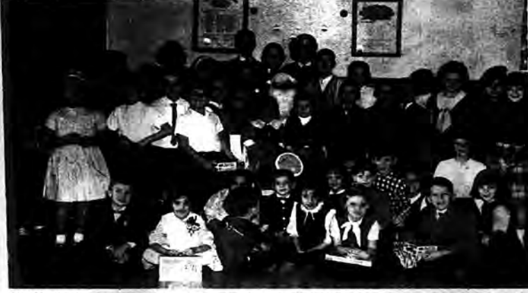
SANTA CLAUS was present when the William M. Gouse Jr Post, Veterans of Foreign Wars of Hicksville, staged a Christmas party at its clubhouse on Grand Ave for the children of members. He distributed gifts to the boys and girls.

Senator Miller of Iowa pro-posed an amendment not to count the seven percent Social Security increase for veterans pension purposes and while approved three times by the Senate, the House rejected it in each in-stance. The V.F.W. campaigned hard to have the Miller amend-ment approved, however, the House has given assurance the pension program will receive a fresh study of the nituations with