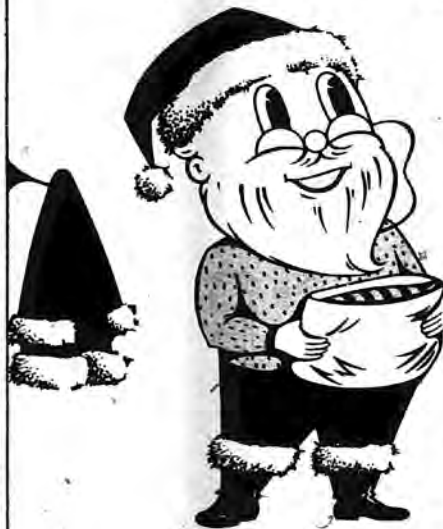
Mr. "Meadow Brook"

you too need help playing Santa... see Meadow Brook National Bank