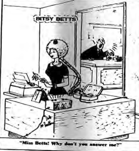
"Miss Betts! Why don't you answer me?"