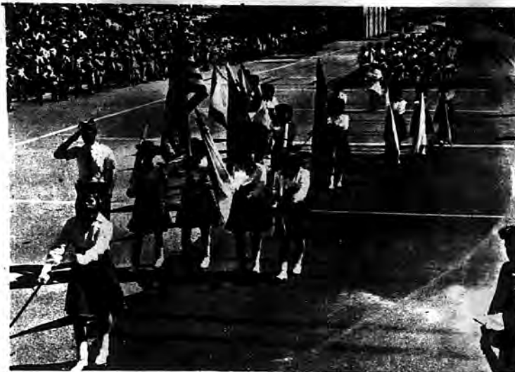
ST. IGNATIUS ALL-GIRL CADET CORPS in the Labor Day Firemen's Parade, Monday, when they won a trophy as one of the best musical units in the line of march. Picture was taken on the racing course at Mid Island Plaza parking field.