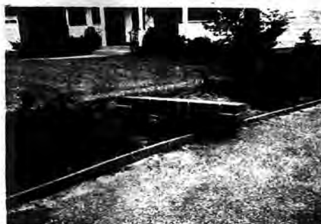
JERICHO WALL COLLAPSES. The brick wall which was located at the rear entrance way to the Cantigue School is shown here after it had fallen and pinned young Steven Visentin beneath it. The light fixture which was used with the wall prevented the wall from falling all the way down to the ground.