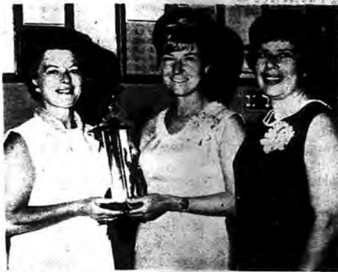
ANNUAL AWARDS LUNCHEON of the Bowling League of the Mid-Island Chapter, NCEDC, Inc. was held this last week at the Plainview Bldg., Plainview, with trophy presentation, Presentation of award monies, and a delicious Buffet luncheon.