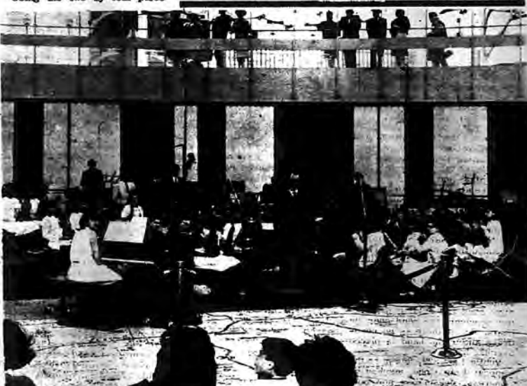
JERICHO J.S.S. SYMPHONY ORCHESTRA of Jericho performed at the New York State Exhibit at the World's Fair on Tuesday, June 15.