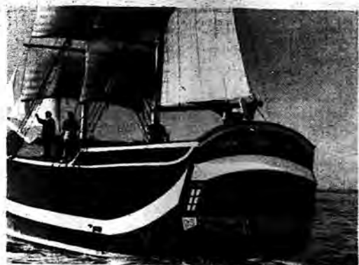
"MARDI GRAS" - the new Guy Lombardo musical spectacular which opens at the Jones Beach Theatre on Saturday, June 26, at 8:30 P.M., will feature many unusual innovations in the beautiful huge water and stage setting. This is an exact replica of Jean Lafitte's ship, La Belle Souverain.