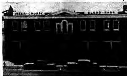
INTER COUNTY BLOOD BANK recently dedicated a modern new facility in Rockville Centre to mark its 23rd year of service. This building formerly was the main office and printing plant of the defunct Nassau County Daily Review-Star. The Bank, a non-profit organization, is affiliated with more than 1500 religious, industrial, social, fraternal and other community organizations. The Bank headquarters were formerly in Jamaica.

This program is sponsored by the County Recreation and Parks Dept. in cooperation with the Hicksville Recreation Dept.