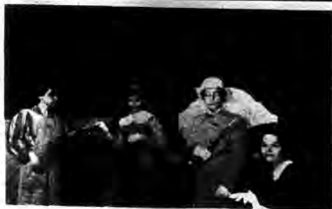
JERICHO LITTLE THEATRE GROUP at a performance which they gave at the annual West Birchwood Civic Assoc. Meeting held on April 14. At this meeting the budget was adopted by the members present as well as the approval of various amendments now to be added to the constitution of the civic association.