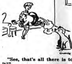
"See, that's all there is to it!"