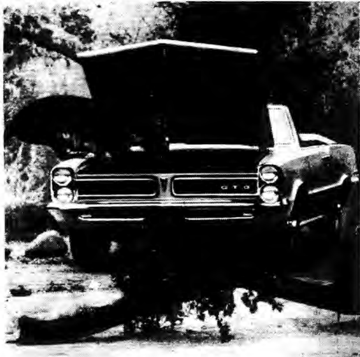
Tigers run in our family

But we keep improving the breed. Check these points: up to 360 hp in the GTO; up to 285 in the Le Mans; bucket seats and rich carpeting in both. Wonder what happened to that tiger? Look under the hood of a GTO.