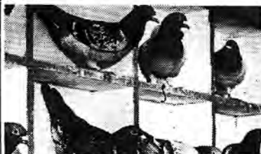
NEST WORTH: A pigeon coop, with apartment-like accommodations for fast-flying birds. Coops and lofts are expensive part of sport.