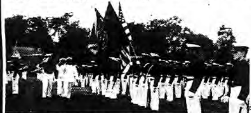
REVIEW: The Academy holds colorful regimental reviews on Saturdays, and is a photographer's paradise.