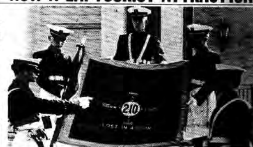
TRIBUTE: To the 210 Cadet-Midshipmen and Kings Point graduates who perished in World War II.