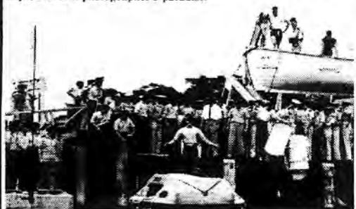
TESTING: Innovations in nautical equipment often receive their initial tests at Kings Point, as this new-type life raft.