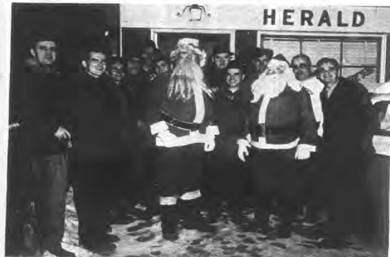
TWINLAWNS CIVIC ASSN. of Hicksville, for the 19th year, will be going from house to house with gifts for the children of the neighborhood on Christmas Eve. The Twinlawn group has continuously carried on the program over the years and does not plan to stop this Thursday evening, no matter what the weather. The area served has developed to such an extent that Santa now needs a fully uniformed helper in addition to all the "boys" from the block. The take off point has always been from the Herald office.