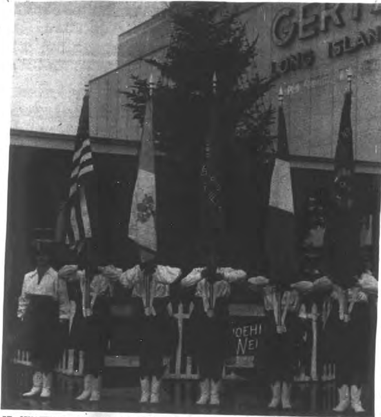
ST. IGNATIUS CADET CORP COLOR GUARD presents colors during ceremonies held at Mid Island Plaza for U.S. Marines "Toys For Tots" Drive. "Christmas Around The World" theme circles the huge Christmas tree as Santa's mail box fills up with requests for toys 'n toys.