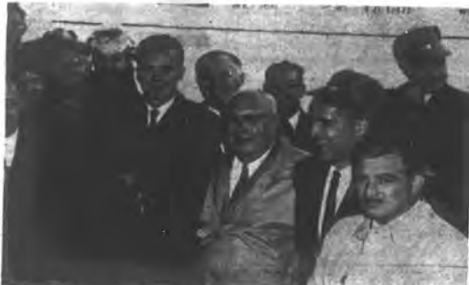
ONE OF HIS most recent public functions was as a special guest at the dedication of the new Hicksville elevated station on Sept. 12, of this year.