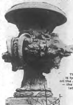
This Romanesque Urn is typical of the statuary on the ASC 23-acre campus - the former estate of the late Wm. K. Vanderbilt

Interested students are invited to inquire about available scholarships, grants-in-aid, and student loans. Awards are determined on the basis of financial need to those students who demonstrate academic achievement, competence in a particular field, or distinctive contributions to some phase of total life of the college. The New York State Scholar Incentive Program plus N. Y. State Higher Education Assistance Plan may be applied at ASC towards college tuition and fees. Requirements for eligibility and full information is available from the Director of Admissions. Write now.