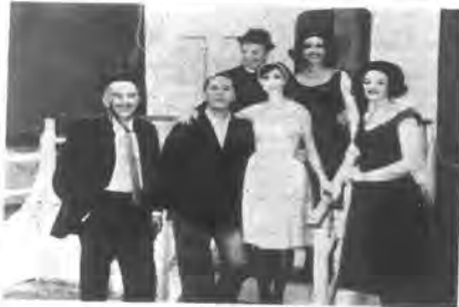
A FEW of the many stars of "Anything Goes," this year's production for the Jericho Scholarship Fund. This year's show was truly outstanding and the performance by the cast and all associated with the show was a real professional presentation.

As in the past, the meeting was very well attended, most informative and thoroughly enjoyable.