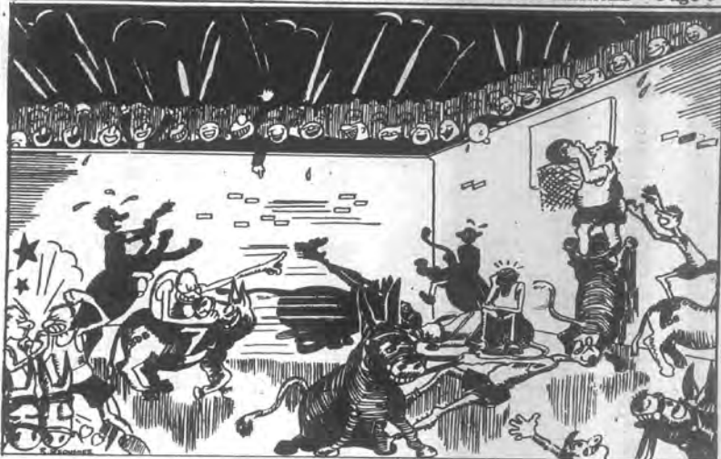
CRAZY MAN' . . . CRAZY . . . Here's a way out bit of Friday-nite nonsense guaranteed to produce a barrelful of belly-laughs. It's a recent Hicksville first and should help to swell the P.T.A.'s Scholarship Fund. (See Around the District)

ALL AROUND TOWN The Hicksville Junior High School P.T.A. will meet on Monday, Dec. 14, at 8:15 P.M. in the school auditorium. The feature for this meeting is a Hootenanny. This group of high school students have previously presented a popular program and an enjoyable evening should be anticipated.