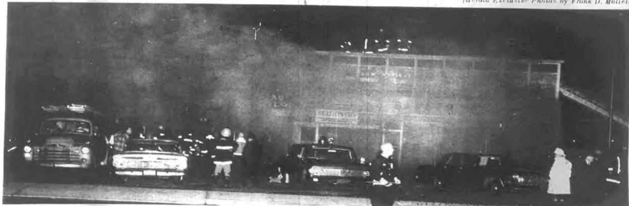
MUCH LATER in the evening. Smoke covered Hicksville for blocks. White specks on the flat roof are firemen with reflective strips on their rain coats.