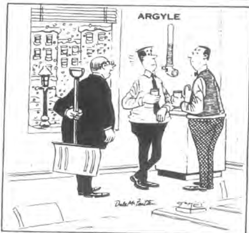
"Did I hear you say you were bored with office work, Argyle?"