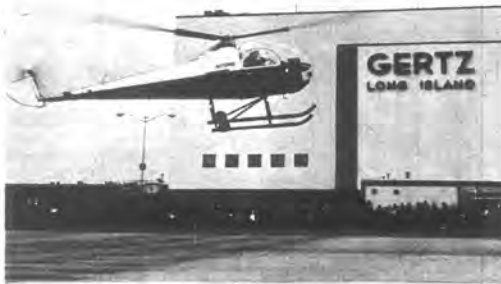
MARINE COLOR GUARD of the 2nd Batt., 25th Marines escorted Santa Saturday, at Mid Island Plaza when he arrived by colorful helicopter at 1 P.M. 3,000 youngsters of all ages were on hand for Santa's arrival courtesy of Gertz.