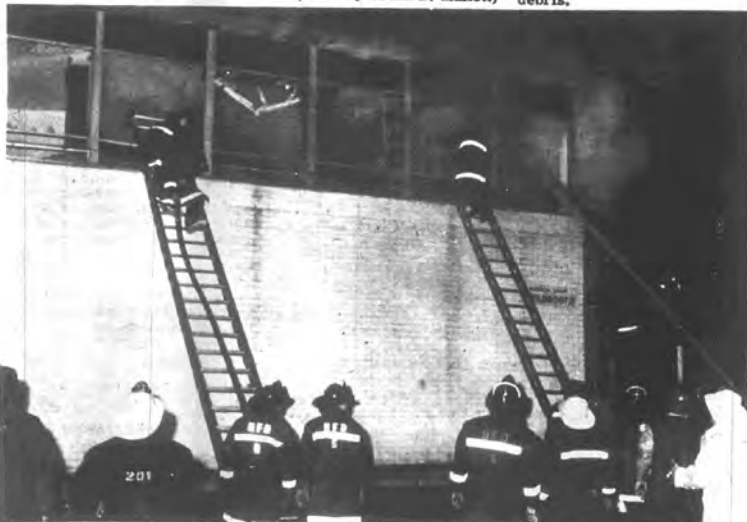
HOSE LINES poured tens of thousand of gallons of water into the flaming Sutter building. This was part of the attack from the rear of the structure.