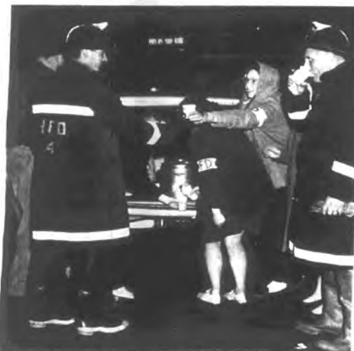
LADIES AUXILIARY of Hicksville Fire Dept. served coffee and hot soup to the volunteers at the Sutter building fire.