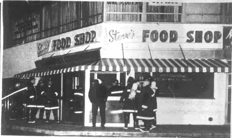
IT WAS SHORTLY AFTER EIGHT O'clock Sunday night when the firmen arrived at the Sutter Building. Volunteers with air packs and charged hose lines prepared to enter the food shop which was full of smoke. Now see below.