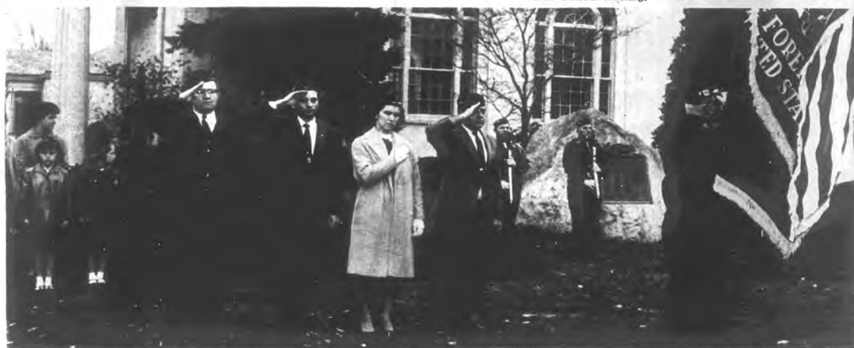
VETERANS DAY at the Hicksville Junior High School where the veterans memorial is located. The hour was 11 o'clock in the