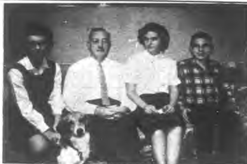
THE PETZHOLT FAMILY