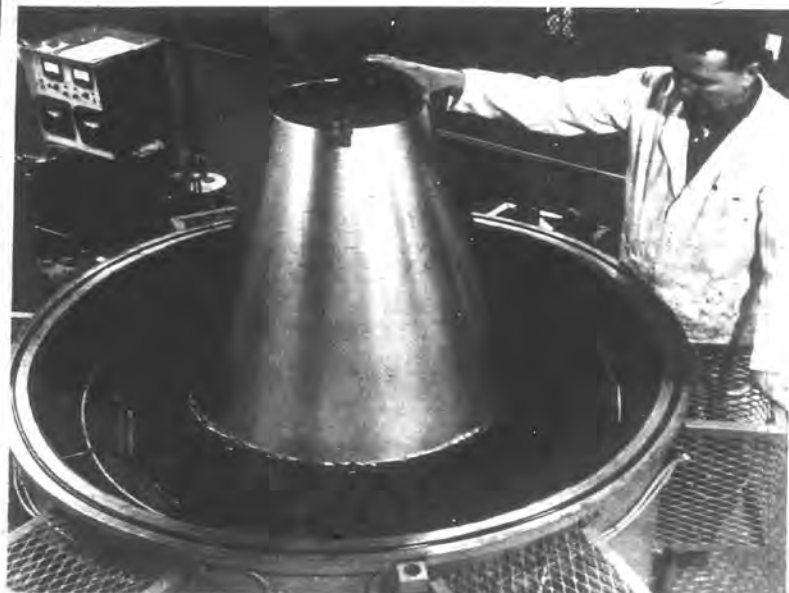
HIGH TEMPERATURE protective coating is applied to this rocket exhaust skirt with the aid of the new vacuum diffusion coating furnace recently installed at Sylvania Electric Products Inc., SYLCOR Division, on Contagium Rd., Hicksville. The vacuum furnace is in the new research and development department at SYLCOR, which is undergoing a scale-up program in order to coat larger aerospace parts. The furnace has a 34-inch diameter and a 36-inch high working area. Its operating temperature is 2200° F. at pressures of 10 -4 and 10 -5 range. The furnace was manufactured by C.I. Hayes Inc. SYLCOR also makes nuclear fuel elements for reactors throughout the world.