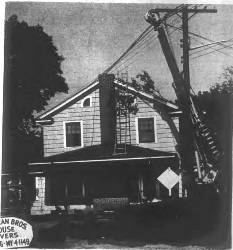
HOUSE MOVING took place on Jerusalem Ave. on Oct. 14 when the Christ house was shifted from the east to the west side to property owned by Small Investments at 174 Jerusalem Ave. The property occupied by the house had been acquired by the public library to make room for expansion approved by the voters.