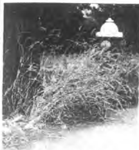
BWAY AND FIRST ST.