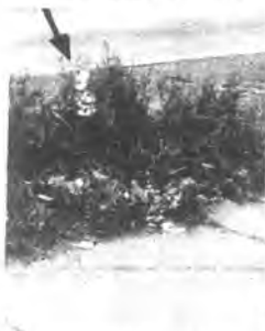
FIND THE HYDRANT