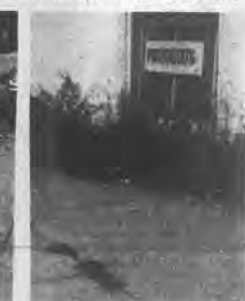
OLD COUNTRY RD. WEST

SOMEONE ONCE SAID that grass will grow in the main streets of American cities and they just may have had Hicksville 1964 in mind. These pictures were taken on Tuesday of this week along Broadway (a state highway) in Hicksville. In some cases the weeds are so high that fire hydrants are invisible. Bringing a little green back to the American scene is all well and good in this age of concrete and steel, but these conditions are ridiculous.