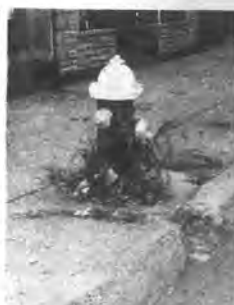
BWAY NORTH OF CARL