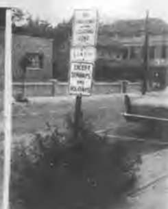
BET. CHERRY & NICHOLAI