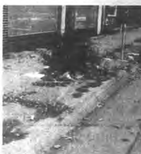
COR. OLD COUNTRY RD.