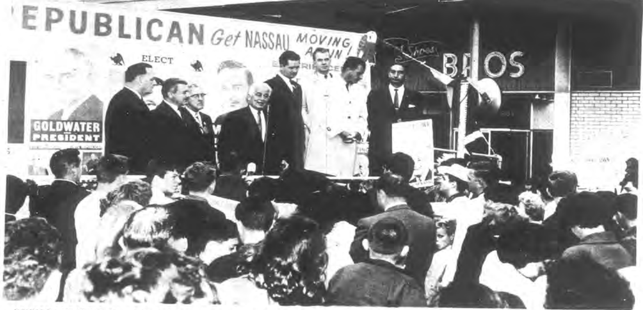
KENNETH KEATING, United States Senator representing New York State, made a personal appearance at the Mid Island Plaza in Hicksville during the week in his campaign for re-election. After some

palver from the speaker platform, Senator Keating went from store to store in the Plaza greeting shoppers and signing autographs.