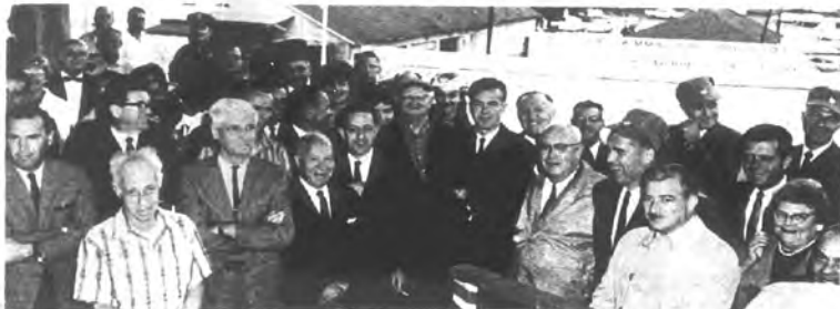
REMARKS of guest speaker, representing State Dept. of Public Works, (lower right) had the audience in a good humor at the RR station, Saturday.

o'clock and by 9:46 when the first train was due the crowd was of good size and the sun was trying to shine. Most of the leading participants are mentioned or shown in the accompany pictures. There were people present in costumes of the time the first train chugged out from Jamaica to Hicksville 127 years ago, linking together the old and the modern.