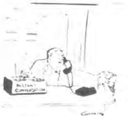
"Yes, dear, what is it?"

When you drive over an obscured railroad crossing too fast to allow you to stop instantly if a train approaches.