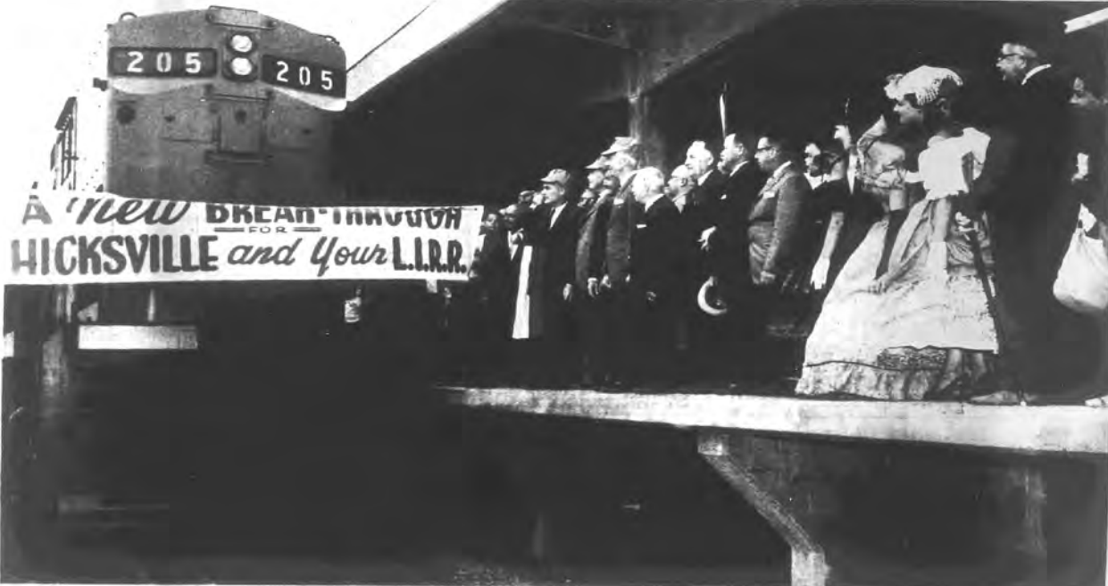
BREAK THROUGH on Saturday morning saw a 35,000 ton diesel locomotive cut thru a paper tape. It was the first train over the top on the Port Jefferson line and the end of rail

round daylight saving time, the vast majority approved and on extension of the length of the public school year, the majority opposed, but it was close. September questions, on ballots now available at local bank offices, besides the presidential race are these: In favor of proposed bridge linking eastern Long Island with New England?, interested in Pay Television assuming calibre of programming to be worthwhile?, and are there adequate playground and other recreational facilities in your community?