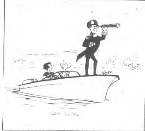
"Owning this boat has gone to his head!"

MID - ISLAND READING CENTER 115A Jerusalem Avenue Hicksville, New York Classes in remedial and corrective reading are now being organized for the second summer session beginning on August 3. Groups will meet for one hour daily between the hours of 8:30 AM and 12 noon until August 28. Each student is individually diagnosed by experienced re- medialists, and a program of instruction is designed to fit his particular needs. Give your child a head start for school in the fall. For further information call GE 3-0568-9 between 8.0 AM and 12 noon.