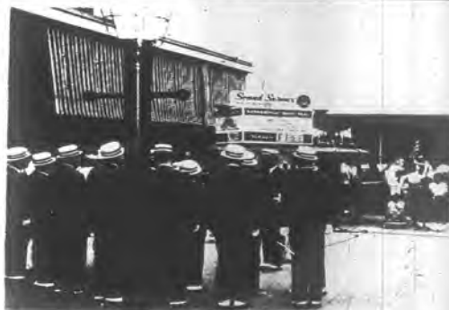
SHOPPERS at Mid Island Plaza Saturday, were treated to some of the old songs by the Mid Island Chapter of the Society for the Preservation of Barber Shop Quartet Singing in America... groups included the popular "Dashing Dons."