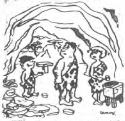
"Can I go on an overnight campout with the gang?"