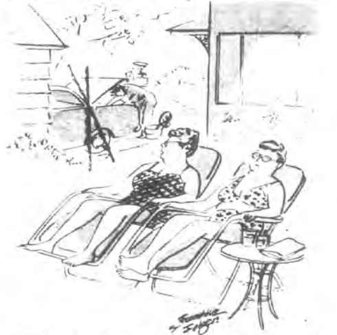
"Imagine - going out in this blazing sun just to fish - sometimes I wonder about men."