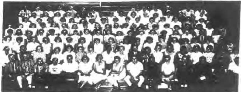
YOUR SUMMER RECREATION staff ready for the opening day, June 29.