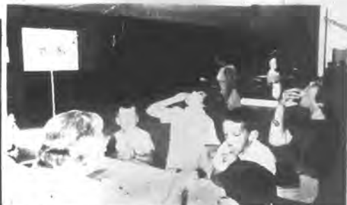
members of the Board of Education and co-chairmen of the event, expressed their deep appreciation to the many resident volunteers who devoted both their time and efforts to work for this activity.