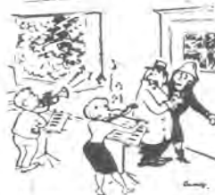
"Your mother and I are just stepping out for a quiet walk in the raging storm."