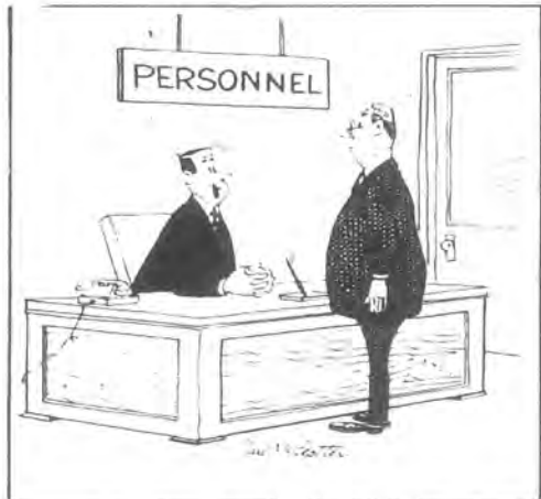
"I'm sure I can handle this job, Mr. Pottleby - by the way, what does 'Personnel' mean?"

MID - ISLAND READING CENTER 115A Jerusalem Avenue Hicksville, New York Summer classes in remedial and corrective reading will begin on June 29 for students now in grades three through twelve. Classes will meet daily Monday through Friday for an hour a day for a period of four weeks. A second session will begin on August 3. Register your child now for reading help. For further information call GE 3-0568 or GE 3-0569 between 4 and 6 P.M. If no answer, call WE 8-7621.