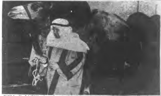
DOM DeLUISE in the role of detective, Mr. Fix, in "Around the World in 80 Days" is caught in one of his many disguises, leading a camel. The show opens for its second season at Jones Beach Marine Theatre on June 27.

Thur.-Fri. June 18-19 A Distant Trumpet 3:40, 7:00, 10:35. Fun in Acapulco 2:00, 8:55. Sat. June 20 A Distant Trumpet 2:00, 5:40, 9:25. Fun in Acapulco 4:00, 7:40. Sun. June 21 West Side Story 2:00, 4:30, 7:00, 9:30. Mon.-Tues. June 22-23 West Side Story 2:00, 7:00, 9:30.