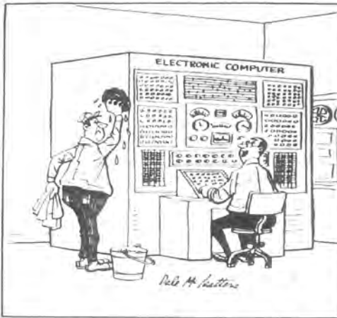
"How's the old 'Brainwasher' today?"