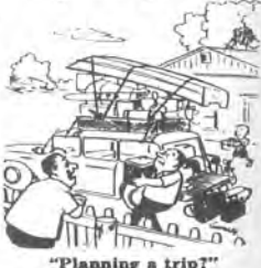
"Planning a trip?"