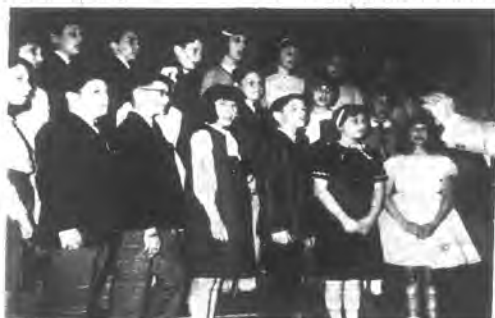
MEMBERS OF CANTIAGUE School Glee Club, as they performed at the Dedication Ceremony of their school, recently.

The ceremony for the tree planting was held on Friday May 22nd and was attended by Girl Scout Troops #212, #357 and #458 as well as Brownie Troops #303, #692 and #265.