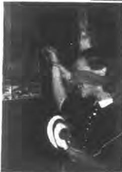
Exhibit Work Of Three Seniors

There will be no delivery service on that day except for Special Delivery. There will be no window service provided in the Main Post Office or any of its branches.