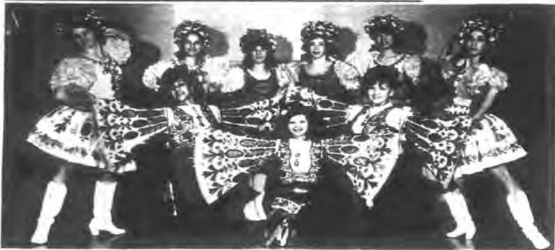
STUDENTS of the French-American Ballet Academy, 245 So. Broadway Hicksville, display the beautiful Hungarian costumes, made in Budapest, that they will wear during a folk dance they will perform at a Dance Recital to be given by the Academy at Hicksville High School auditorium on Saturday, June 27 at 8:15 p.m. Proceeds will go to the Hicksville High School PTA Scholarship Fund. Donation is $1.50. Tickets may be obtained at the Academy.