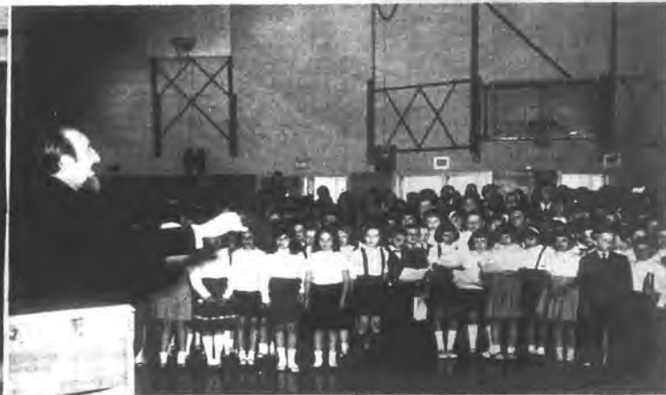
president of the Hicksville Board of Education stands by. At the right Miller leads a group of foreign language students in a song fest. There were approximately 1,000 children and nearly 2,000 adults present, necessitating not one but two sing along with Mitch sessions.