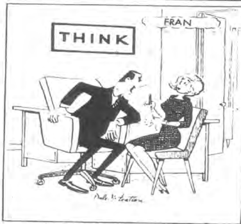
"Miss Betts, I've been thinking..."

RUMMAGE SALE Temple Beth Elohim 929 Round Swamp Rd. Old Bethpage Tues. May 5 thru Thur. May 7 Daily: 10 a.m. to 4 p.m. Wed. May 6 7 to 9 p.m.