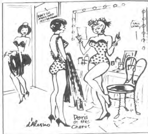
"You're the Second National Bank, see? Now listen to my excuse for being overdrawn and tell me how it sounds!"

TUTORING Experienced mathematics tutor. High school algebra, geometry, trig, etc. Call OV 1-8432.