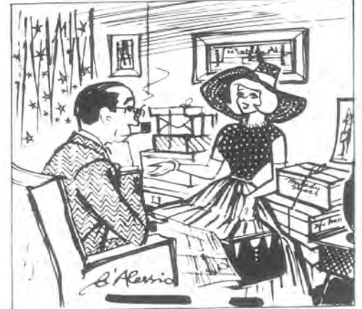
"I saved $24.67 hunting for bargains today—Hand it over!"