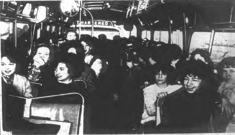
ON THEIR WAY to Stanbrooke Lodge, Rhinebeck, New York, for an overnight winter sports trip are these gay teenagers.