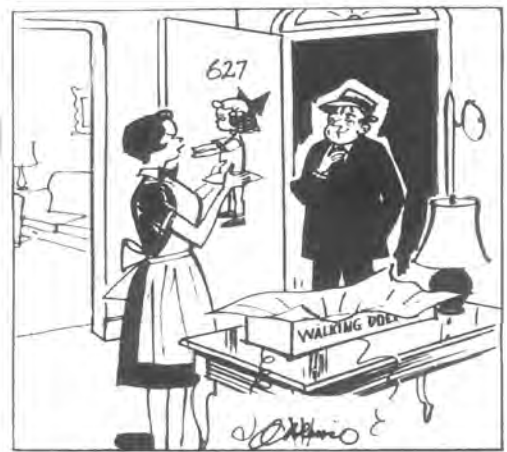
"You're very gallant but next time you remember my birthday, DON'T forget my age!"