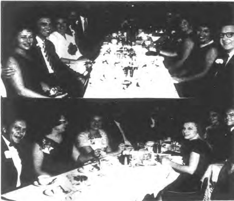
ENJOYING A PRIVATE DINNER on Homecoming Day are members of the Class of 1943. Afterwards they moved to their tables in the new Hicksville American Legion Hall to join the other Alumni in celebrating the 27-20 triumph over Island Trees. Over 400 Alumni, players, cheerleaders and members of the band joined the Alumni in the traditional reception in the Cafeteria after the contest.