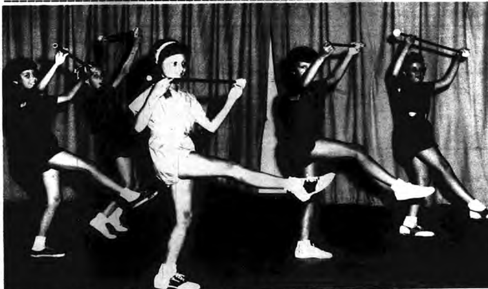
BATON TWIRLING - Elementary school girls interested in baton twirling can be registered at the Fourth St. Entrance of the Hicksville Junior High School. The registration will take place from

10 A.M. until noon on Saturday, Oct. 26. Lessons will be scheduled on Saturday with appointments being made according to age, skill and convenience.