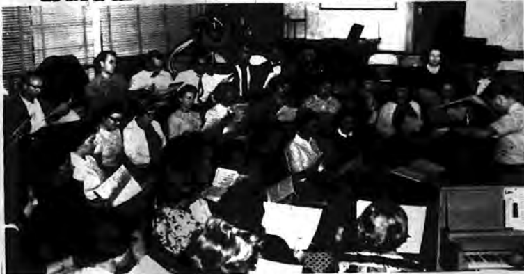
COMMUNITY CHORUS PREPARES CONCERT

FOR INFORMATION ABOUT RECREATION Phone WE 5-9000 Ext 292 or 352