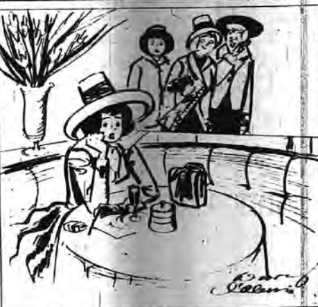
"Poor LIZA — she only got to page ten of her cook book when her husband up and left her!"

Don't borrow money for Chris- mas. Borrow a Stanley Chris- mas case. PE 5-2915.