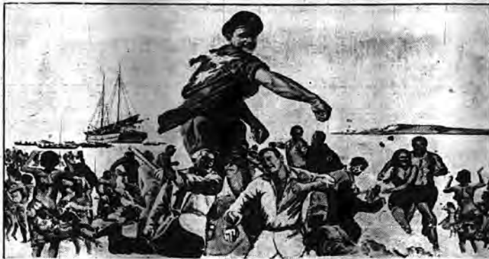
HERE COMES John Wayne, star in the rough-and-tumble adventure film "Donovan's Reef" now showing at the Hicksville Theatre. Also featured are Elizabeth Allen, Lee Marvin, Dorothy Lamour, Jack Warden and Cesar Romero.