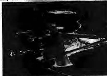
HICKSVILLE AIRPARK from an altitude of about 1500 feet, looking south. The flying field, main banger and smaller buildings are visible in the lower laft hand sector. In upper right is the incinerator and sandpit. Northern Saite Parkway, then under construction, snakes across the upper right, Surrottoding area was mostly farm and woodlass.

EAST HAMPTON AIRPORT was little more than a landing strip back in 1945 when Hicksville Airpark was trying to get started and tangling every mosth with legal problems. This is the East Hampton modern general aviation airport today.