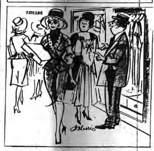
"I don't know my wife's size, but she looked like that in 1948!"