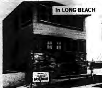
In LONG BEACH