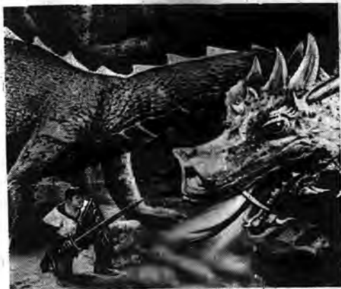
BUDDY HACKETT battles a fearful dragon in "Singing Bone", fairy tale sequence of "The Wonderful World of the Brothers Grimm" starting Sunday, Aug. 25, at the Hicksville Theatre. It is being shown for the first time at popular prices, uncut, direct from roadshow engagements.