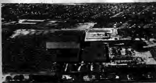
MID ISLAND SHOPPING PLAZA off North Broadway has been assessed by the county at $4,839,090 (of which $1,549,573 is the assessment for land) which is an increase of $54,850 over the final assessment for the last taxing year. This figure includes reduction won by the Plaza in court in August 1960.

SPECIAL SALE Aluminum gutters and leaders 65¢ per foot completely installed. HA 3-4974 D. Watson