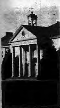
CLOCK'S SANS HANDS

Some months ago, the clapper from the clock tower disappeared and was returned almost as mysteriously.