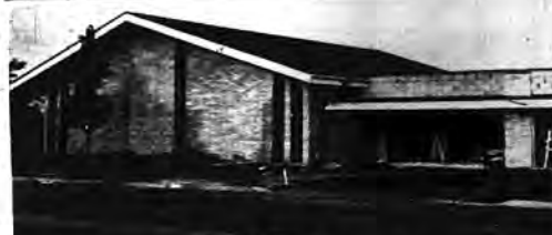
FIRST SECTION of Temple Beth Torah nears completion in time for the High Holidays. This section is the first of three and contains the Sanctuary in addition to other rooms. It is located on Cantigue Road just south of Northern State Parkway.