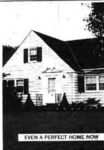
EVEN A PERFECT HOME NOW