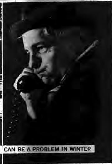
CAN BE A PROBLEM IN WINTER