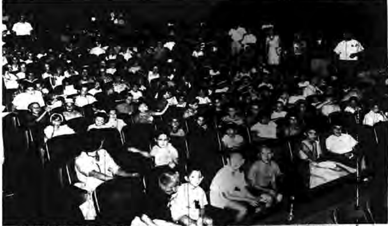
HICKSVILLE YOUNGSTERS enjoying one of the many special trips last sea-

ing in Auditorium-No registration necessary. Summer Reading Club: This years theme is "World Traveler" for children who have completed the third grade. Six weeks, from July 1st to August St. To Be Read-6 books on a subject, 3 fiction, 3 non-fiction, Registration