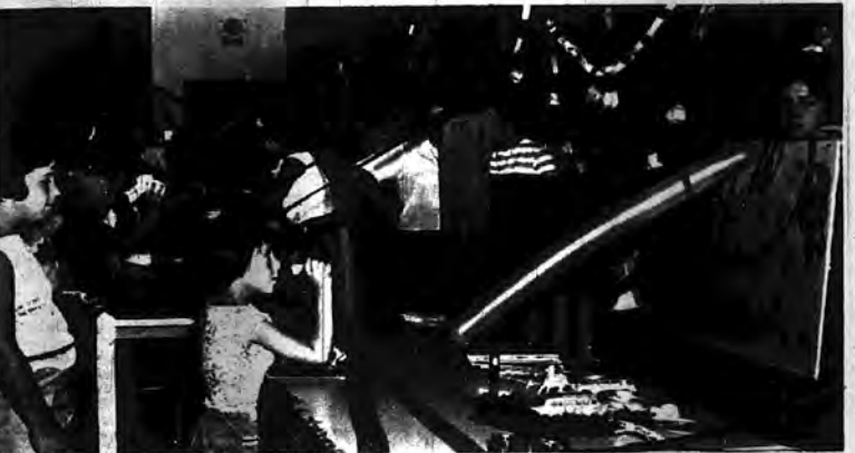
FUN AT THE CARNIVAL, a special event held at Burns Ave School.

"There are always two chances to win an argument with an umpire—slim and