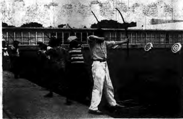
REGISTRATION FOR P.M. Tennis, Golf and Archery instruction will take place in the High School Gymnasium from 1 to 3 p.m. on Monday, July 1, (A.M. Tennis registration will be from 9:30 a.m. to 11:30 a.m. at the same date and place.) All children and youth of the district are invited to register. Les-