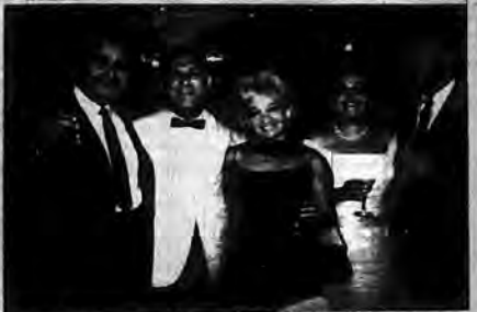
MISCELLANEOUS views at the bowling league dinner at the Pine Hollow, Monday night. See Ten Pin Talk for details.