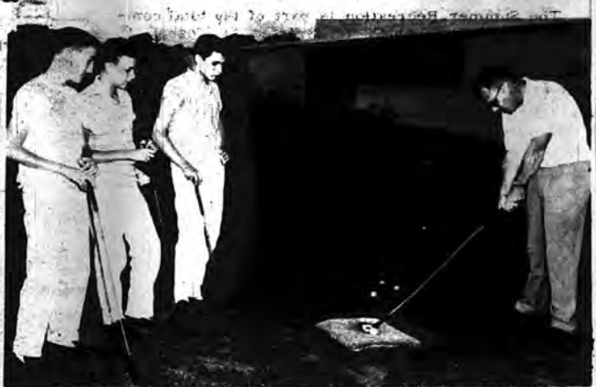
sons will be set up on an appointment basis and groups will be formed according to age and ability. Equipment is available. An individual may register in all three. Tournaments will be featured in each of these activities.