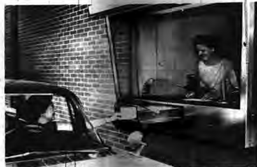
CURB SERVICE FOR SAVERS. At the "drive-in" window of The Williamsburgh Savings Bank's Nassau Office, Hempstead Turnpike and Center Lane, Levittown, a customer hands her deposit directly from her car to the bank teller.