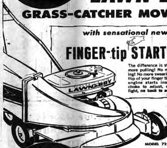
MODEL 7252, 21" CUT

The difference is startling! No more pulling! No more straining! No more swearing! A quick flip of your finger tips, and the engine starts instantly. No choke to adjust, no rope to fight, no back to ache!