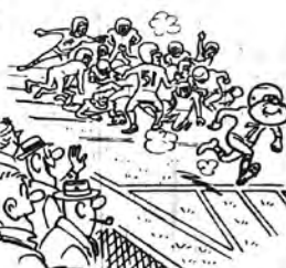
"Greatest hidden-ball play I've ever seen!"

2 Root Lane, Hicksville, N.Y. Mar. 25, 1963