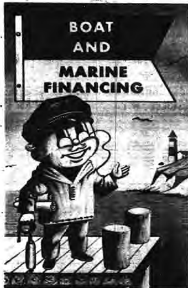
MR. "MEADOW BROOK"

For complete boat financing and other marine equipment set your course for The Meadow Brook National Bank with conveniently-located offices on all points of the compass in New York City and on Long Island.