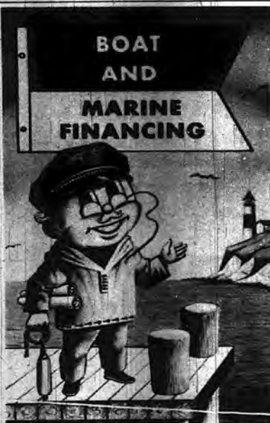
MR. "MEADOW BROOK"

For complete boat financing and other marine equipment set your course for The Meadow Brook National Bank with conveniently located offices on all points of the compass in New York City and on Long Island.