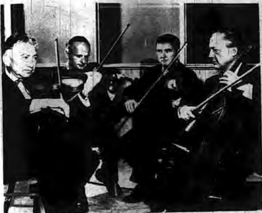
Mid-Island Concert Assoc., presents the Paganini Quartet as the third of its four concert series, on Sunday, Feb. 24, at 3 p.m. at the auditorium of the Hicksville High School.