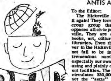
The Fifth Freedom- enjoy it!

The library is proposing an extension costing $298,500. This will be paid over a 20 year period, it will provide for over 40,000 additional volumes; a young adult area to provide for 22 additional seats and facilities for more books; and an improved community room. seats and facilities for more books; and an improved community room seating 182 persons in comfort. This enables the library to main-tain purchasing of materials, to meet the challenge of students and to make the library a true cul-bural center by providing varily improved facilities for programs, meetings and exhibits.