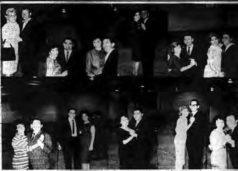
AMONG THOSE WHO ENJOYED the West Birchwood Civic Assoc election dance.