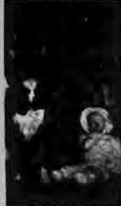
BOOTS, a tri-colored black male shepherd with a white chest, has been missing since Nov. 9 and you can make a couple of youngsters very happy if you can report his whereabouts by calling OV 1-4732. A reward has been offered.