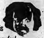
Bette Davis and Joan Crawford