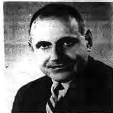
The following residents of the 3rd Congressional District join in urging that you vote for

REGENTS' PRAYER: "I cannot, in good conscience, agree with the Supreme Court's interpretation of the Constitution in ruling out the Regents' Prayer in our schools. I have proposed a constitutional amendment to permit a non-denominational, non-compulsory prayer in our schools for those children who want to pray."