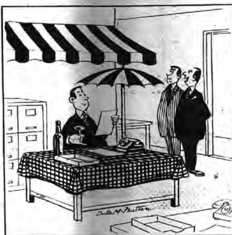
"He can't get over his vacation in Paris!"

PIANO LESSONS. Privately taught in your home. Beginners and players. Classical and popular. Progressive method. ED 4-6484.